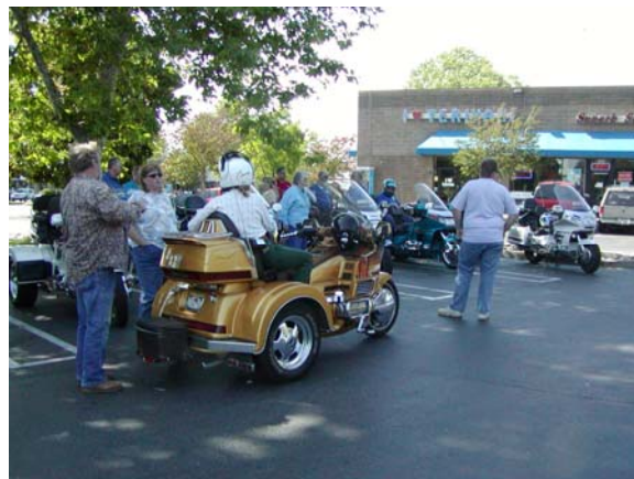
Just waiting around!!

Keep the Shiny Side Up Ride Safely Your Mileage Maker