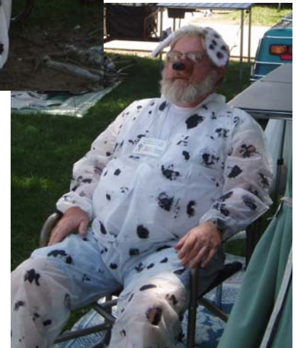
Two Very Tired Doggies