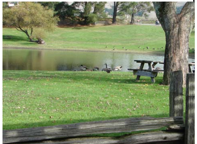
The geese and small pond at the Marin French Cheese Company