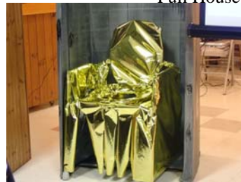
Golden Throne-seat of honor!