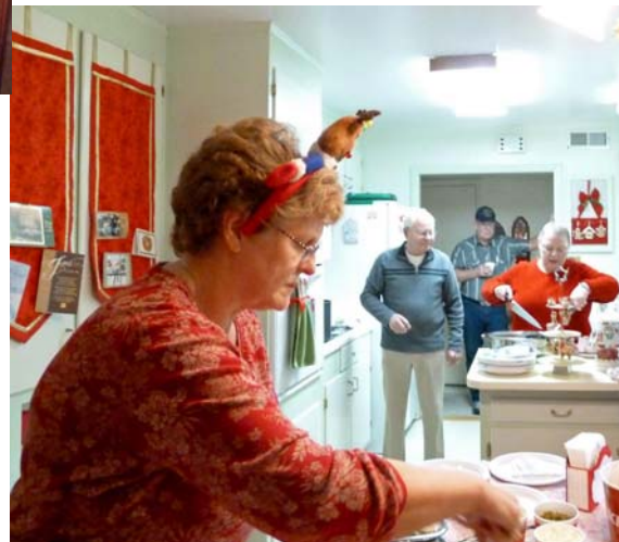
Getting the food ready