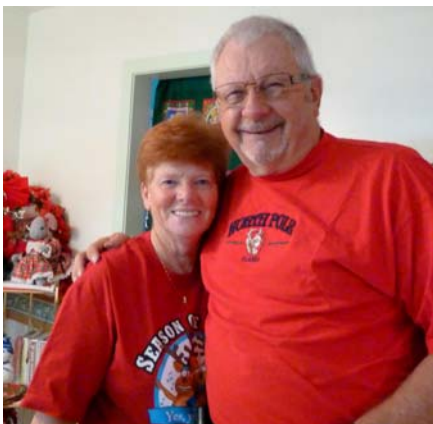
Having a good time!!!

No, Mike wasn't a bad boy, just wanted to sit in the corner.