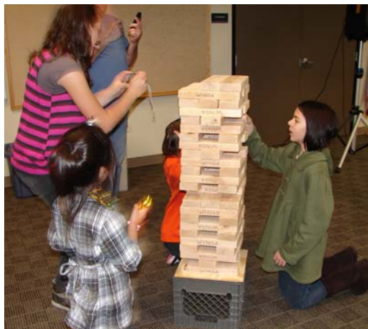
Some of the kids having fun.

The only picture that I was able to use from the party, the rest didn't turnout