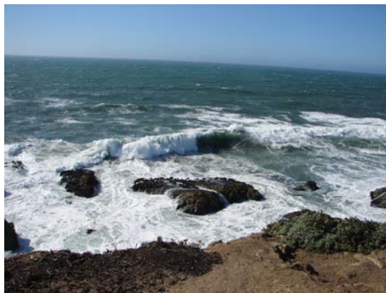
Nice BIG waves