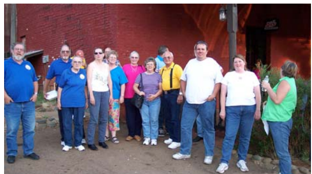
The group after dinner in Foresthill.